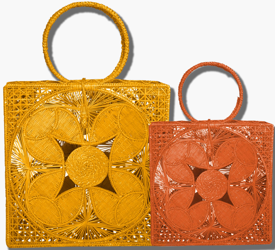
ALTO - 28 x 28 x 10 MSRP $298

The Elisa tote is available in two silhouettes and a variety of seasonal colors. Minimums for wholesale pricing will be 12 units. To receive bulk pricing tiers and a tailored quote for your upcoming event or gifting initiative, please contact us directly.